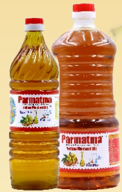
YELLOW MUSTARD OIL