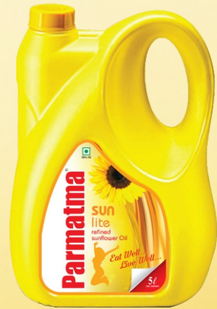
REFINED SUNFLOWER OIL