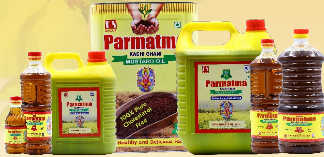
KACHI GHANI MUSTARD OIL