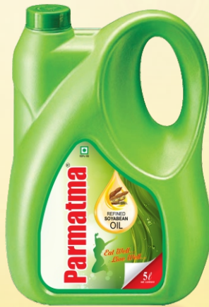
REFINED SOYABEAN OIL